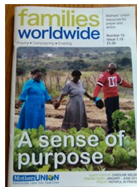
Families Worldwide: a resource for prayer and action