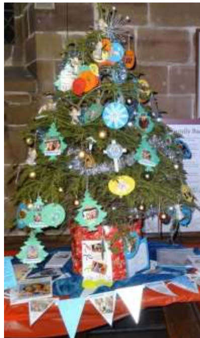
St Mary's Stafford